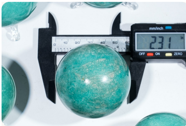
Sphere diameter should be checked across the widest point.