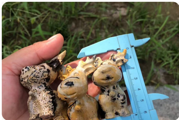
Caliper photos help confirm carving height and width.