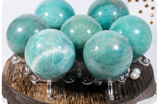
Retail-ready sphere sets shown with display stands.