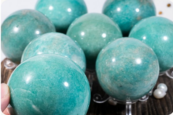
Polished natural stone spheres in coordinated material groups.

Gemstone spheres work well in premium displays, online product photography, gifting, and color-based collections.