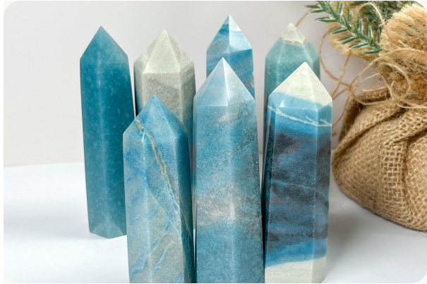
Blue-toned towers for coordinated color collections and display bundles.