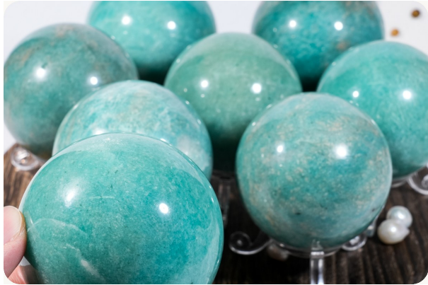
Polished gemstone spheres for display, gifting, decor, and specialty retail.