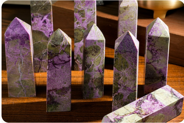
Statement tower sets with polished points and natural pattern variation.

Polished towers are easy to merchandise, visually consistent in shelf displays, and suitable for material-based collections.