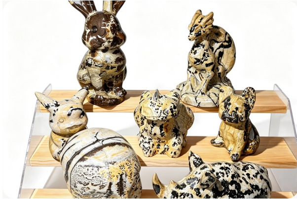
Small crystal carvings for gift, collectible, and themed retail assortments.

Our core assortment is built around three active product families: Crystal Carvings, Crystal Towers & Points, and Crystal Spheres. Each collection can be sourced in multiple materials, sizes, and packaging formats for B2B buyers.