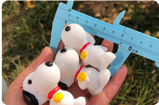
Mini carvings suitable for gift sets, counter displays, and mixed lots.